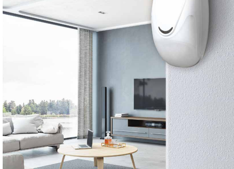
Mouse 02 Mouse 09 Mouse 09/P